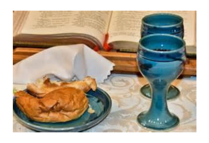
Youth Sunday School

A timeless tradition of teaching youth about the importance of their relationships with Jesus Christ and the importance of constantly being in His word... Our youth Sunday school program is one that seeks to be a bridge for these needs for the youth in our faith community!